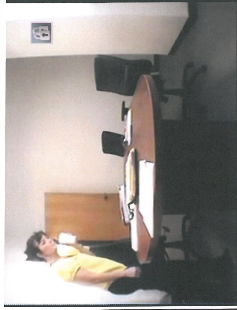
Judge Flood alone in interview room during break