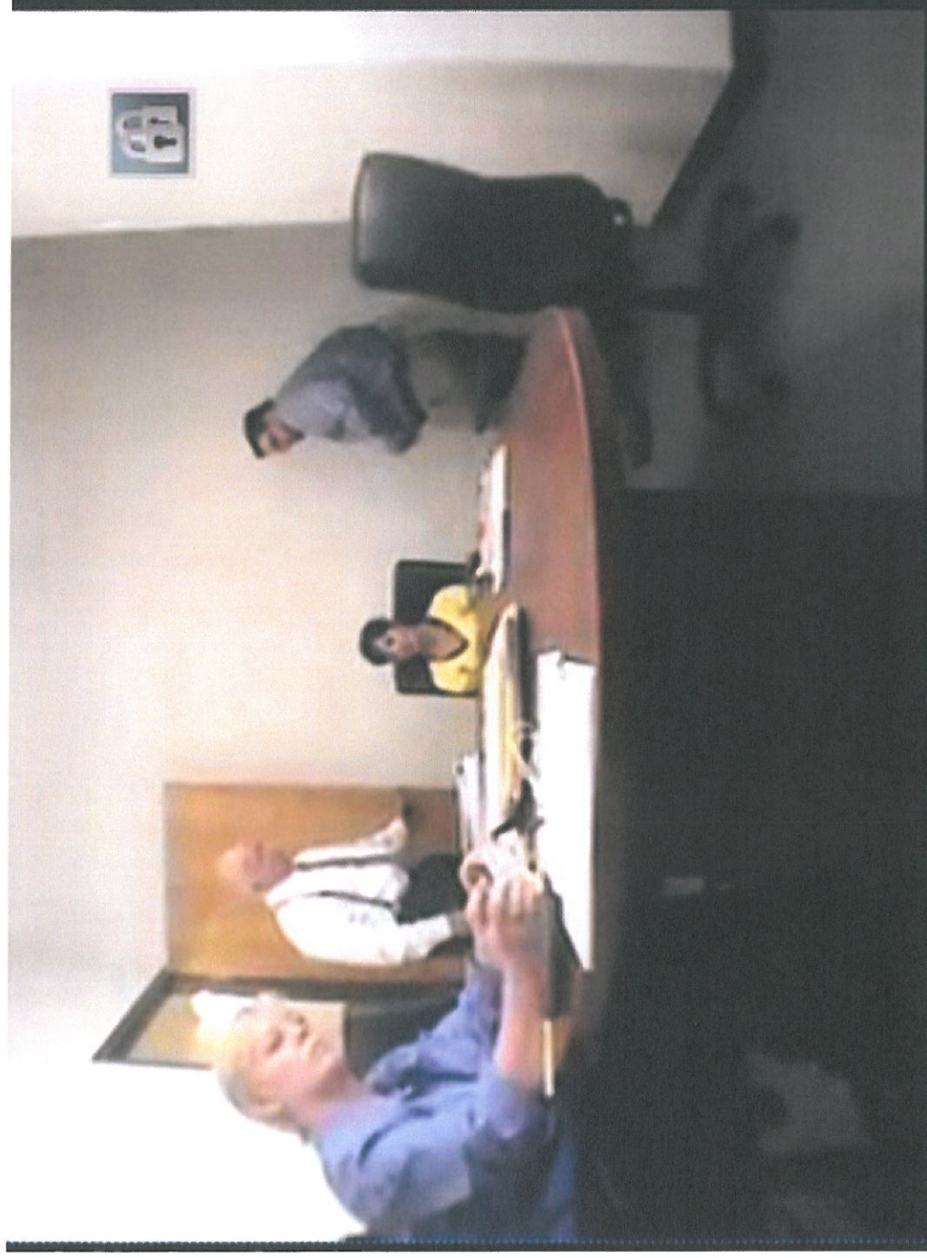
SAO interviewers exiting room prior to break